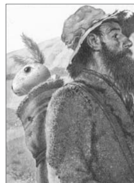
Edward rode in Bull’s bedroll, slung over Bull’s shoulder with only his head and ears sticking out.

A. The best thing I know to tell parents and teachers about motivating young readers is that reading should not be presented to them as a chore, a duty. It should, instead, be offered as a gift: Look, I will help you unwrap this miraculous present. I will show you how to use it for your own satisfaction and education and deep, intense pleasure. It distresses me that parents insist that their children read or make them read. I think the best way for children to treasure reading is for them to see the adults in their lives reading for their own pleasure.